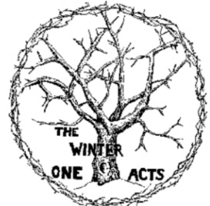
The Winter One Acts are performed at the high school located at 13385 Roachton Road.

Tickets are $8 and available online beginning at 7 p.m. on January 8, at www.tinyurl.com/perrysburgtheatre , at the high school box office on January 17 and 18 from 7 to 8 p.m. and one hour prior to performances. All seats are reserved.